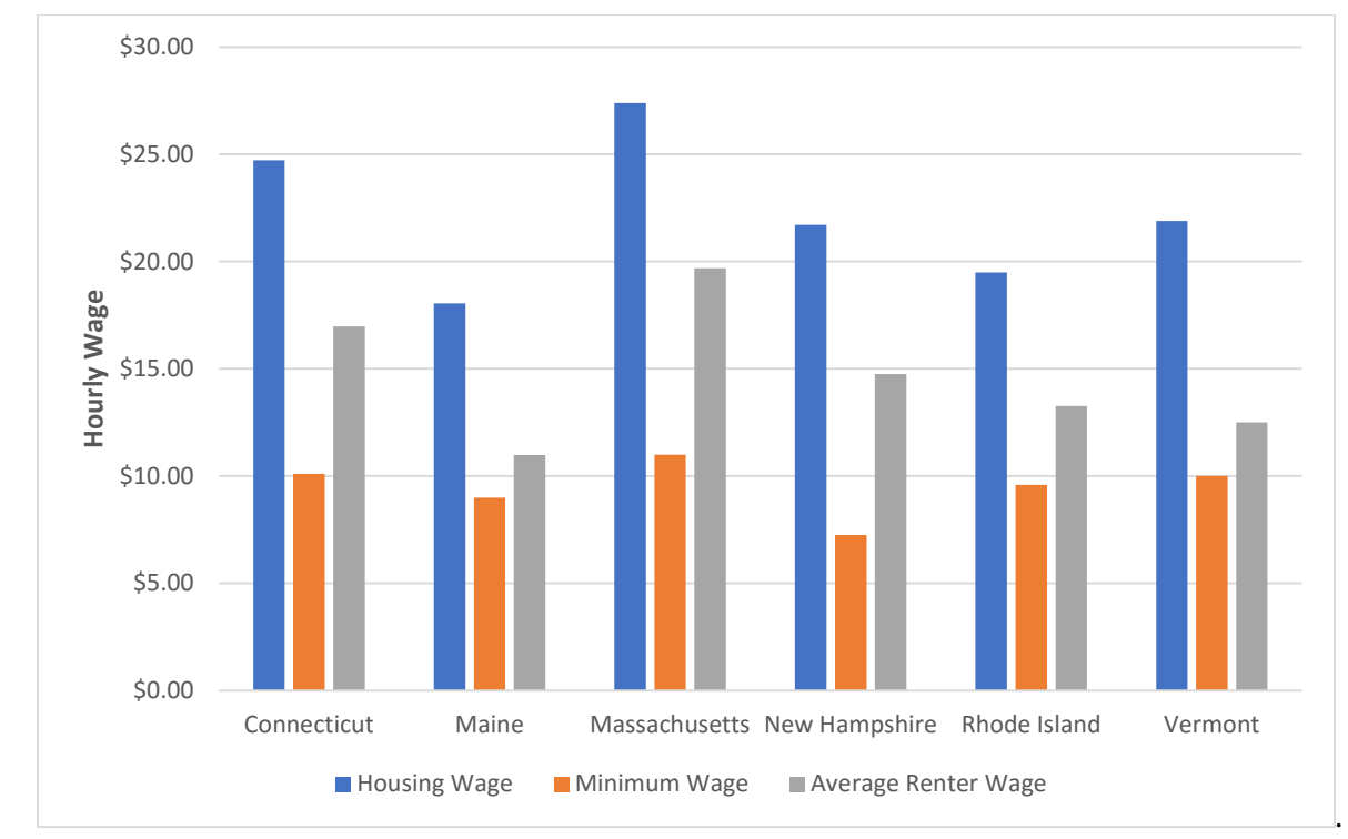
Figure 1. Housing Wages Compared with Average Renter Income and Minimum Wage

The figure and table below illustrate the gap between what the average renter and a minimum wage employee earn, and the housing wage needed. The chart shows the hourly difference at the state level between these three wages. In terms of annual earnings, the gap facing minimum wage earners was at least $18,000 in each New England state; in Connecticut, Massachusetts, and New Hampshire, the gap was greater than $30,000 per year. The average rental earner fell short by at least $12,000 annually in each state.<sup>4</sup>