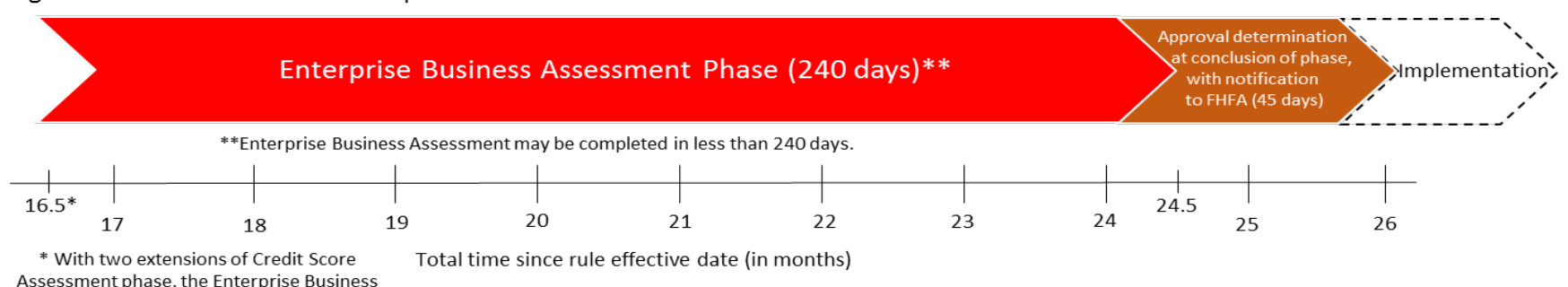
Figure 3: Illustration of Initial Enterprise Business Assessment Maximum Timeframe