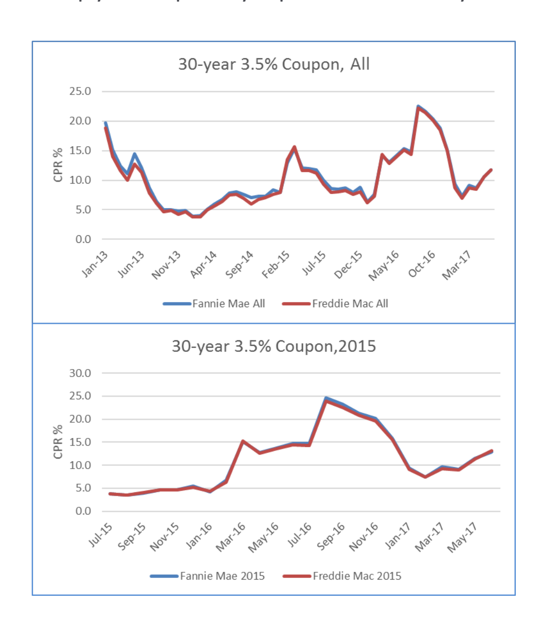
Chart B-3: Prepayment Comparison by Coupon for All Issuance and by Issuance Year

FHFA also uses line charts as illustrated in Chart B-3 below to compare Fannie Mae's MBS and Freddie Mac's MBS prepayment speeds and to evaluate the degree of alignment on a historical basis. Since 2013, the prepayment experience on the Enterprises' MBS have been very closely aligned.